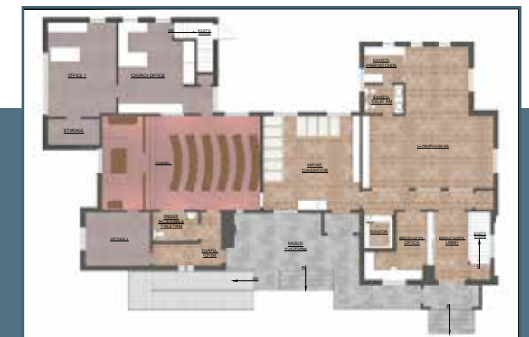
Main Level Floor Plan