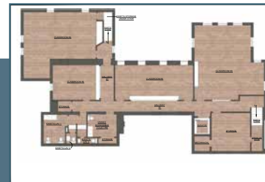
Lower Level Floor Plan